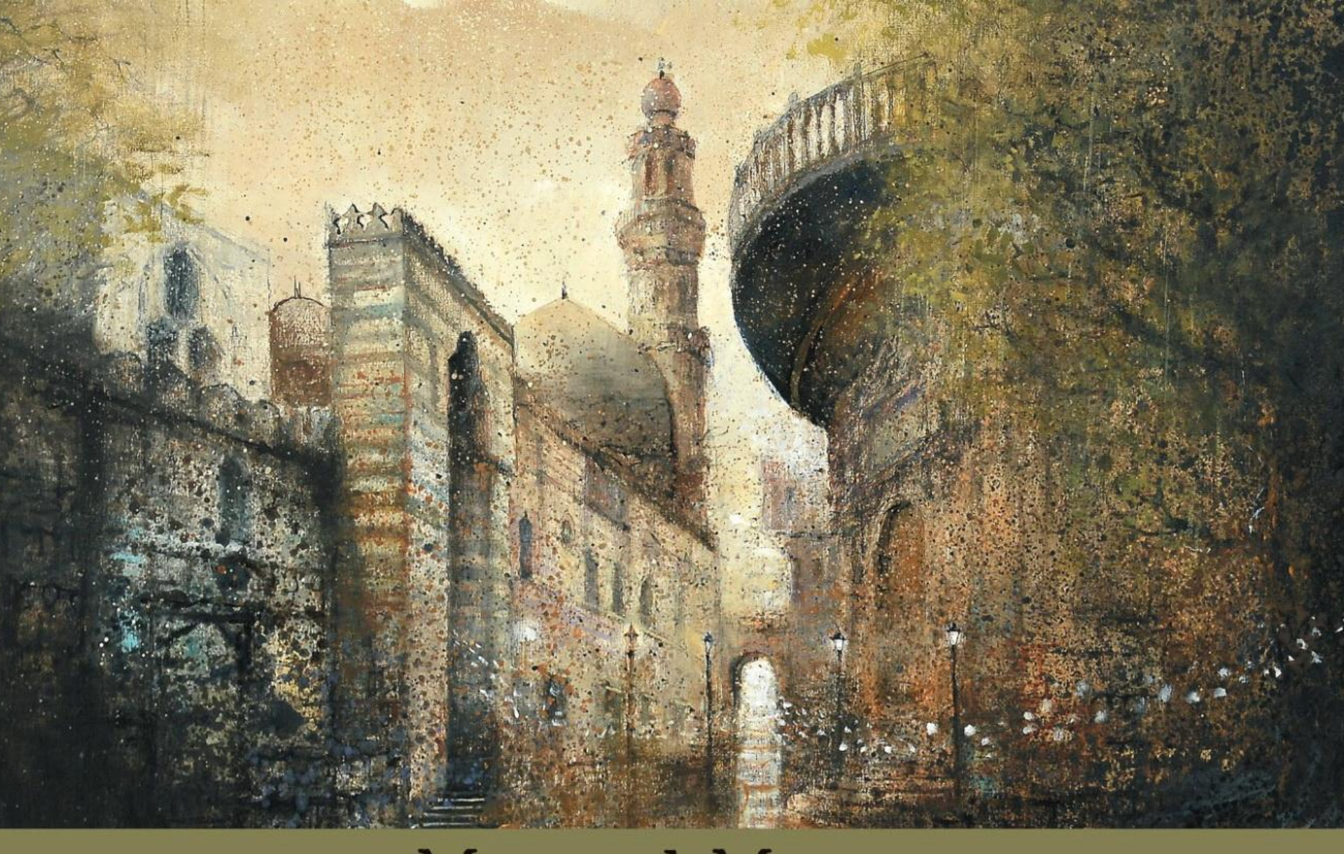
Mystical Mosaic A.Q. Arif