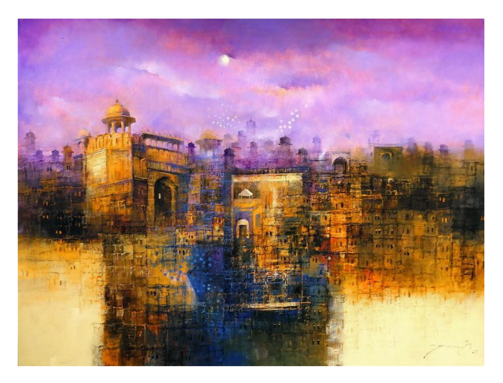
36 x 48, Oil on Canvas, Cityscape Painting, AC-AQ-138, Rs. 230,000 ($2160.00)