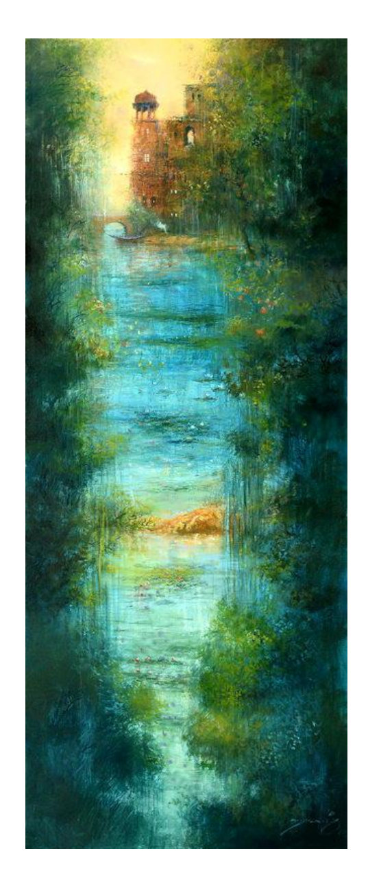
24\,x 60, Oil on Canvas, Cityscape Painting, AC-AQ-145 , Rs. 230,000 ($2160.00)