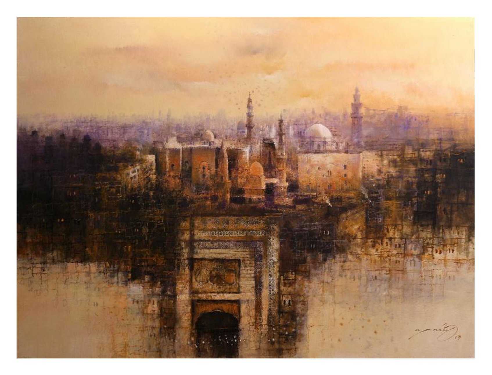
36 x 48, Oil on Canvas, Cityscape Painting, AC-AQ-158, Rs. 230,000 ($2160.00)