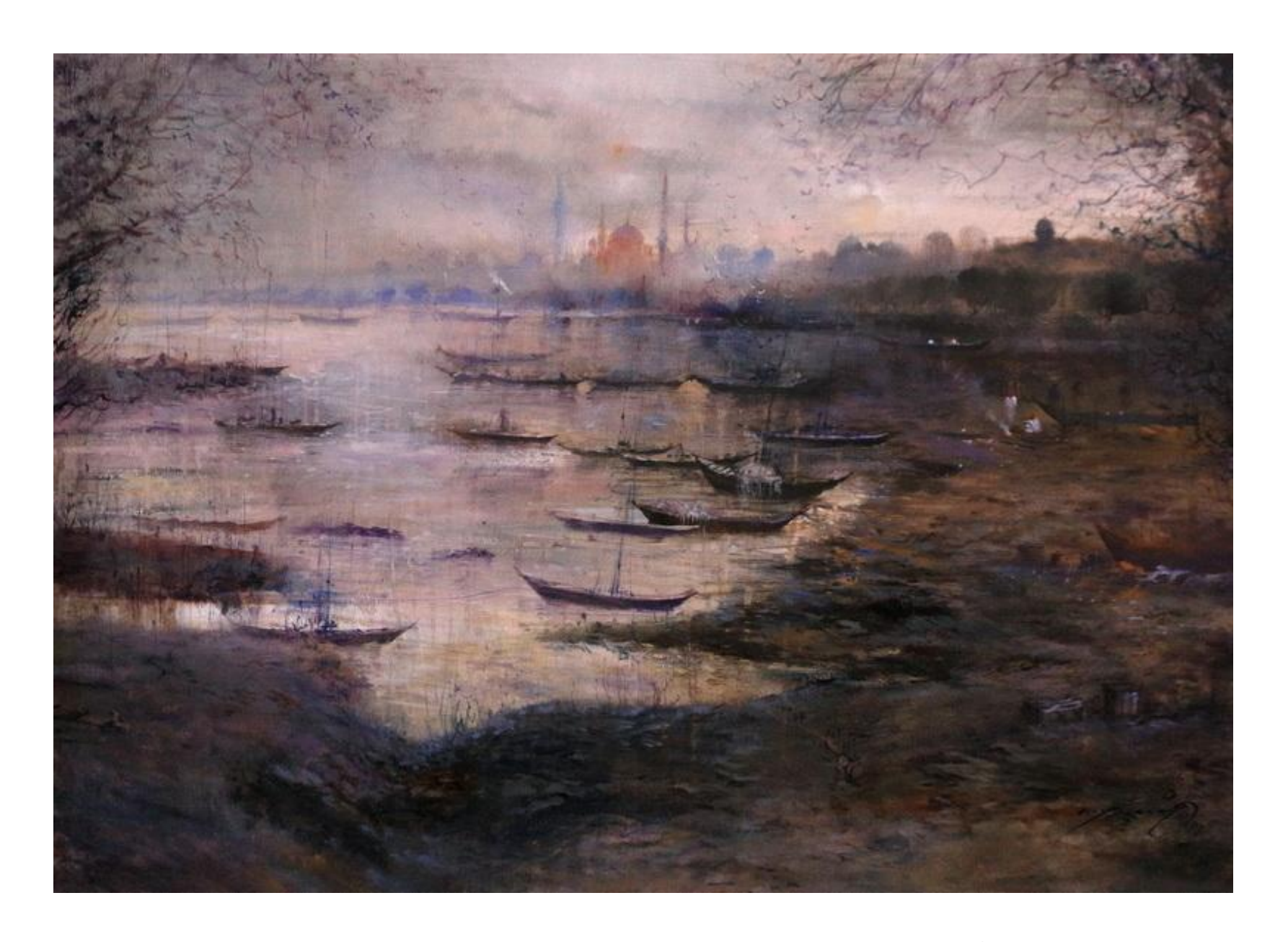
30 x 42, Oil on Canvas, Cityscape Painting, AC-AQ-158, Rs. 190,000 ($1786.00)