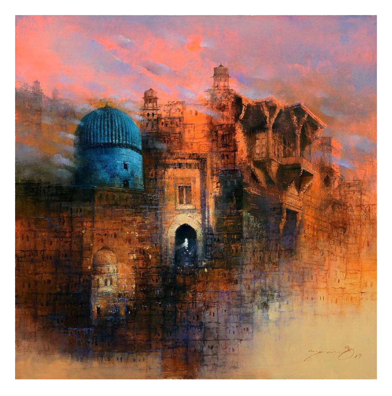
36 x 36, Oil on Canvas, Cityscape Painting, AC-AQ-139, Rs. 180,000 ($1692.00)