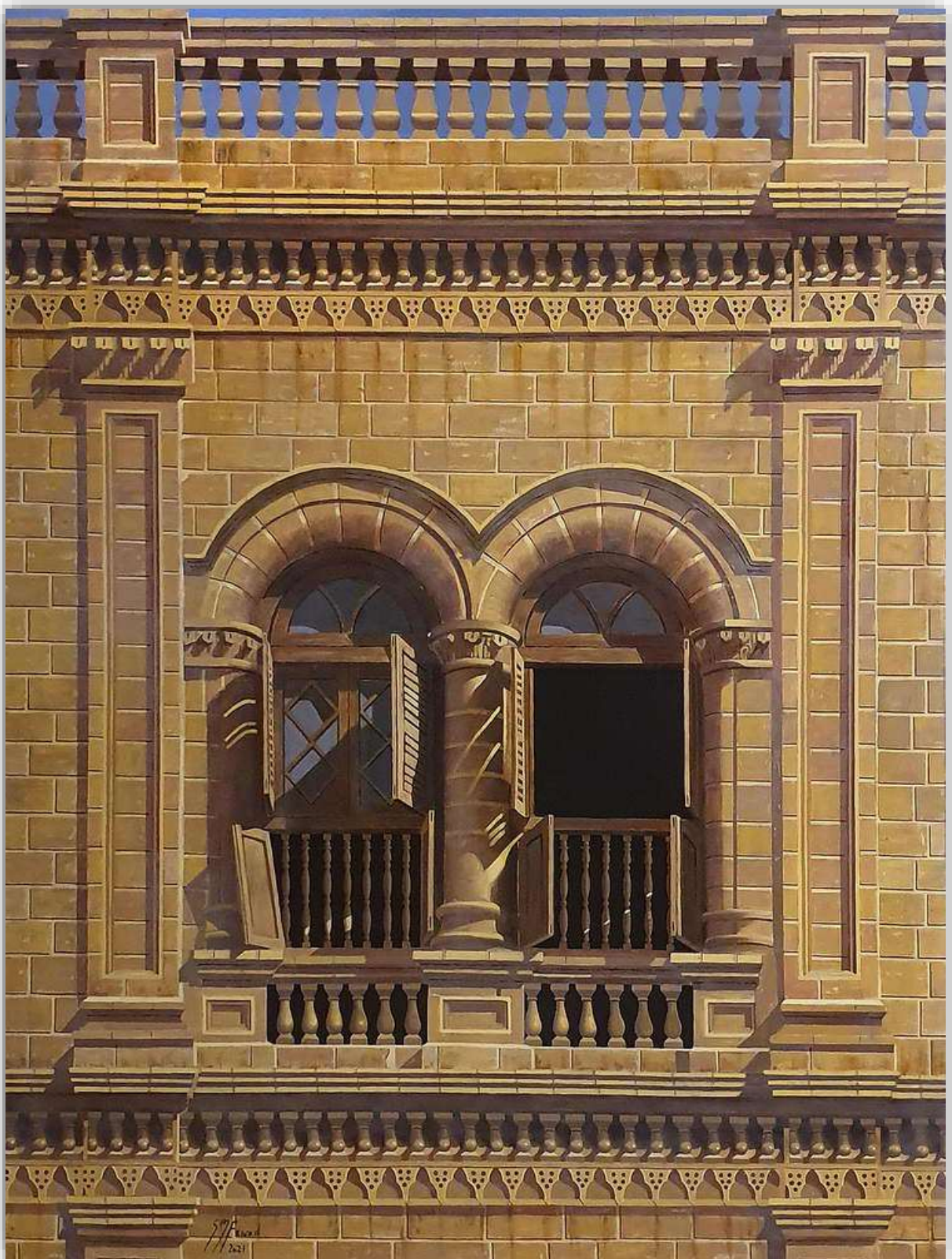
S.M. Fawad Khor Garden, Karachi 44 x 34 Inch, Oil on Canvas, AC-SMF-195 Rs. 200,000 ($ 1,126.76)