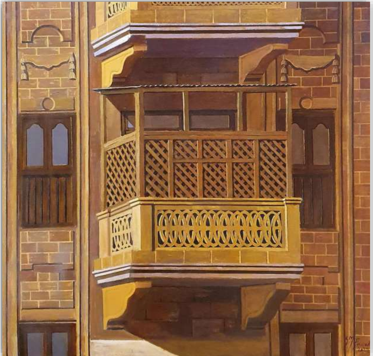
S.M. Fawad Light House, Karachi 24 x 23 Inch, Oil on Canvas, AC-SMF-188 Rs. 90,000 ($ 507.04)