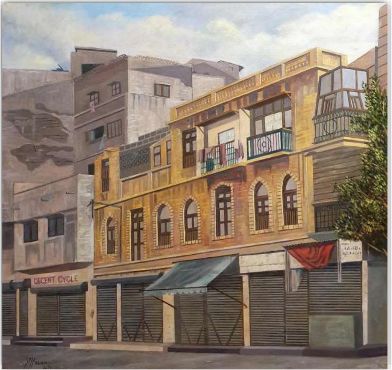
S.M. Fawad Cycle Market, Light House, Karachi 30 x 30Inch, Oil on Canvas, AC-SMF-173 Rs. 110,000 ($ 619.71)