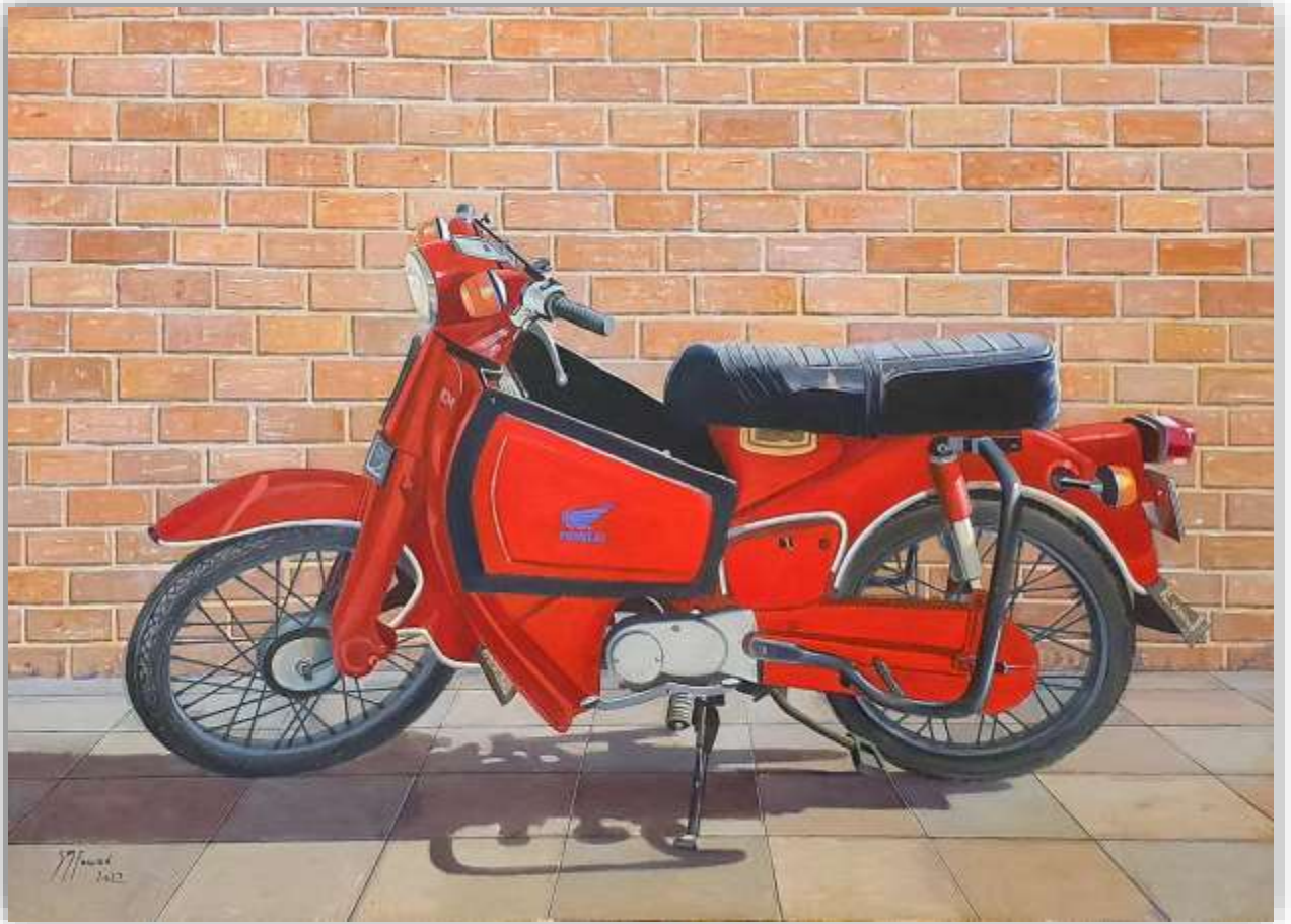
S.M. Fawad Honda Fifty 26 x 36 Inch, Oil on Canvas, AC-SMF-186 Rs. 220,000 ($ 1,239.43)