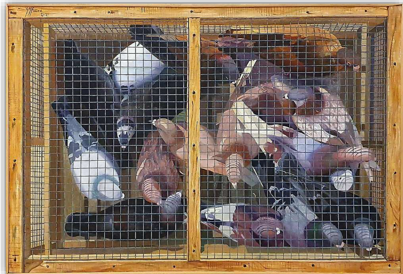
S.M. Fawad Waiting To Fly 20 x 30 Inch, Oil on Canvas, AC-SMF-191 Rs. 200,000 ($ 1,126.76)