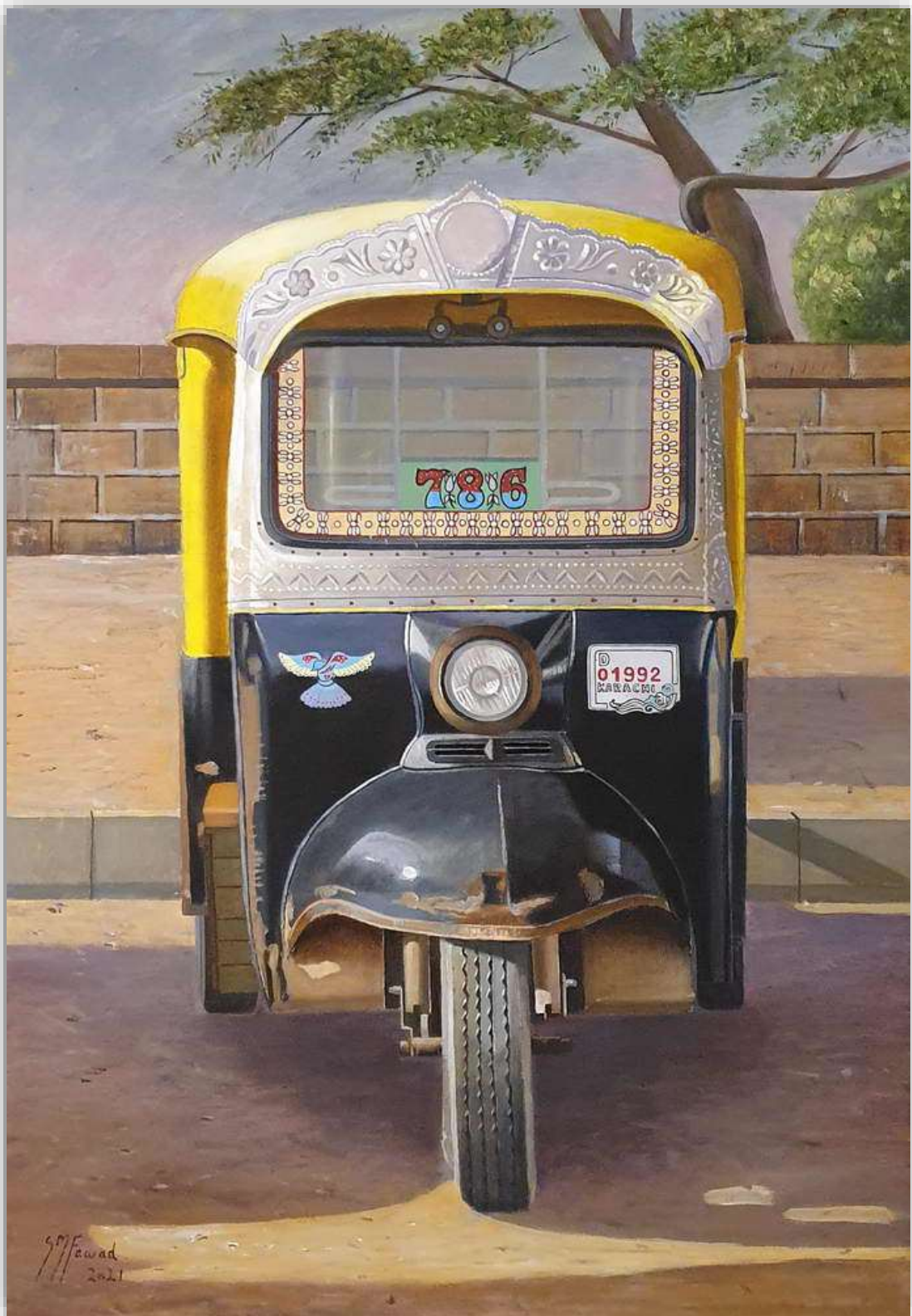
S.M. Fawad Old Riksha 36 x 24 Inch, Oil on Canvas, AC-SMF-176 Rs. 170,000 ($ 957.74)