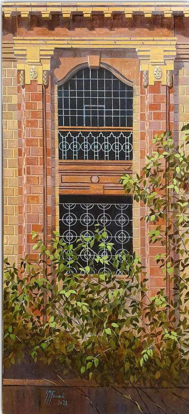
S.M. Fawad Khor Garden, Karachi 34 x 14 Inch, Oil on Canvas, AC-SMF-181 Rs. 90,000 ($ 507.04)