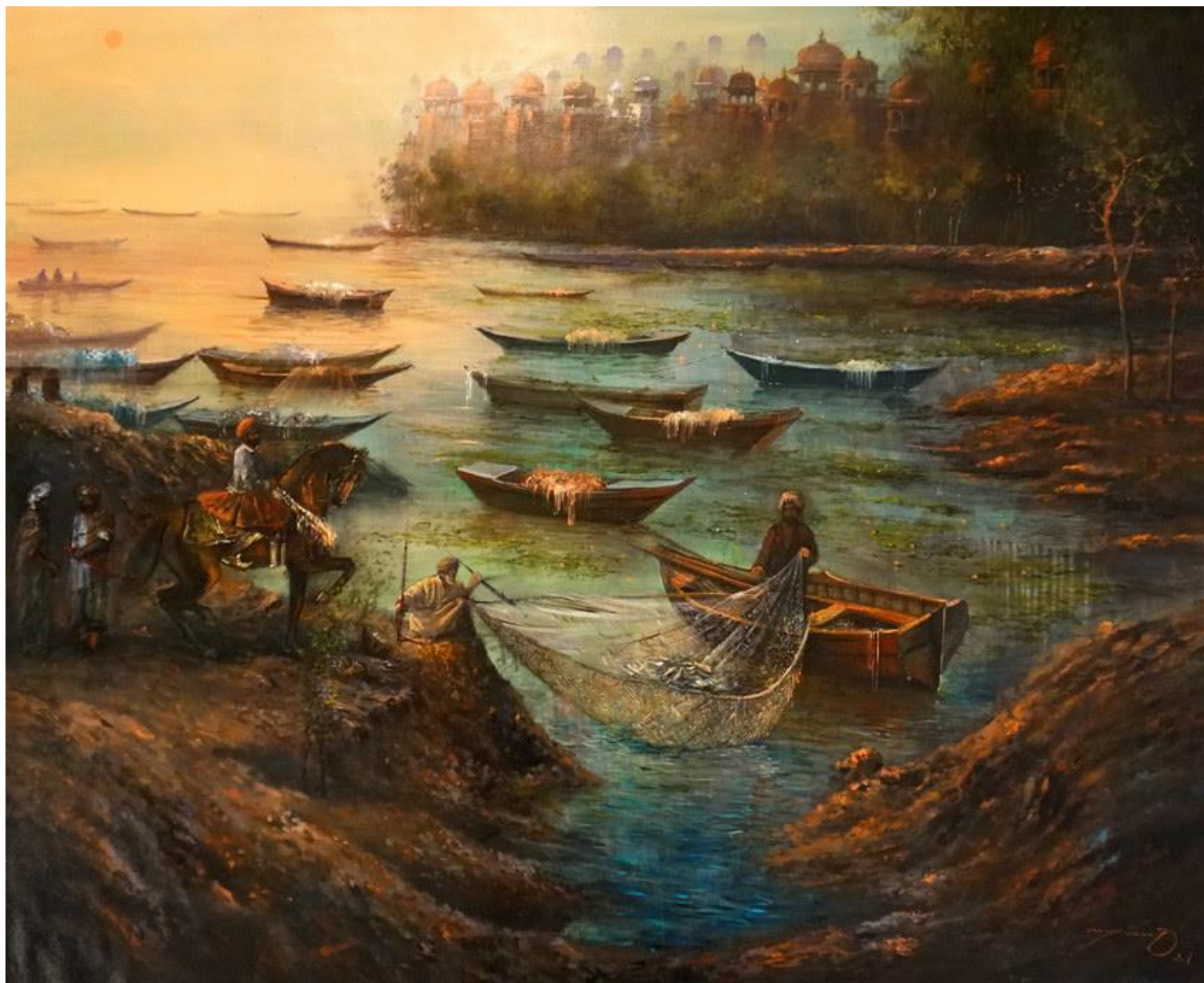
Royal fishing harbour Oil on Canvas 48 x 60 Inch AC-AQ-386 Rs. 650,000 ($3,714.28)