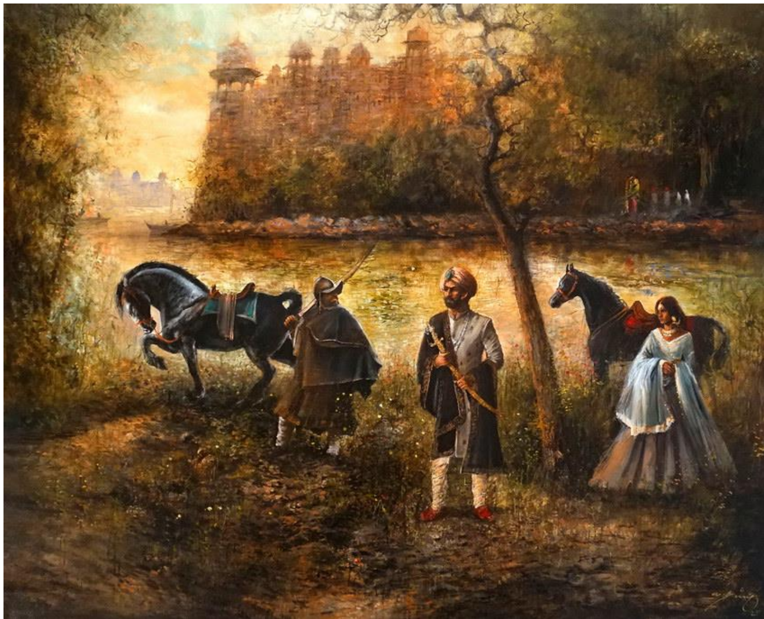
Tranquility Oil on Canvas 48 x 60 Inch AC-AQ-385 Rs. 650,000 ($3,714.28)